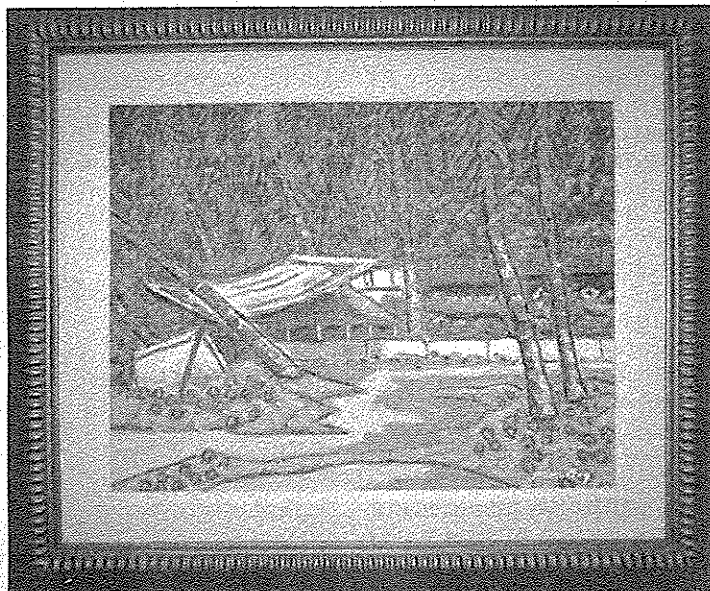
This watercolour of a Mexican fishing village by Chief Justice Roy McMurtry, along with other works by lawyers and judges, is being sold through silent auction to raise money for the Lawyers Feed the Hungry Program. Viewing noon to 2 p.m. at the Museum Room at The Law Society of Upper Canada, with bidding closed at 7:30 p.m. next Wednesday.